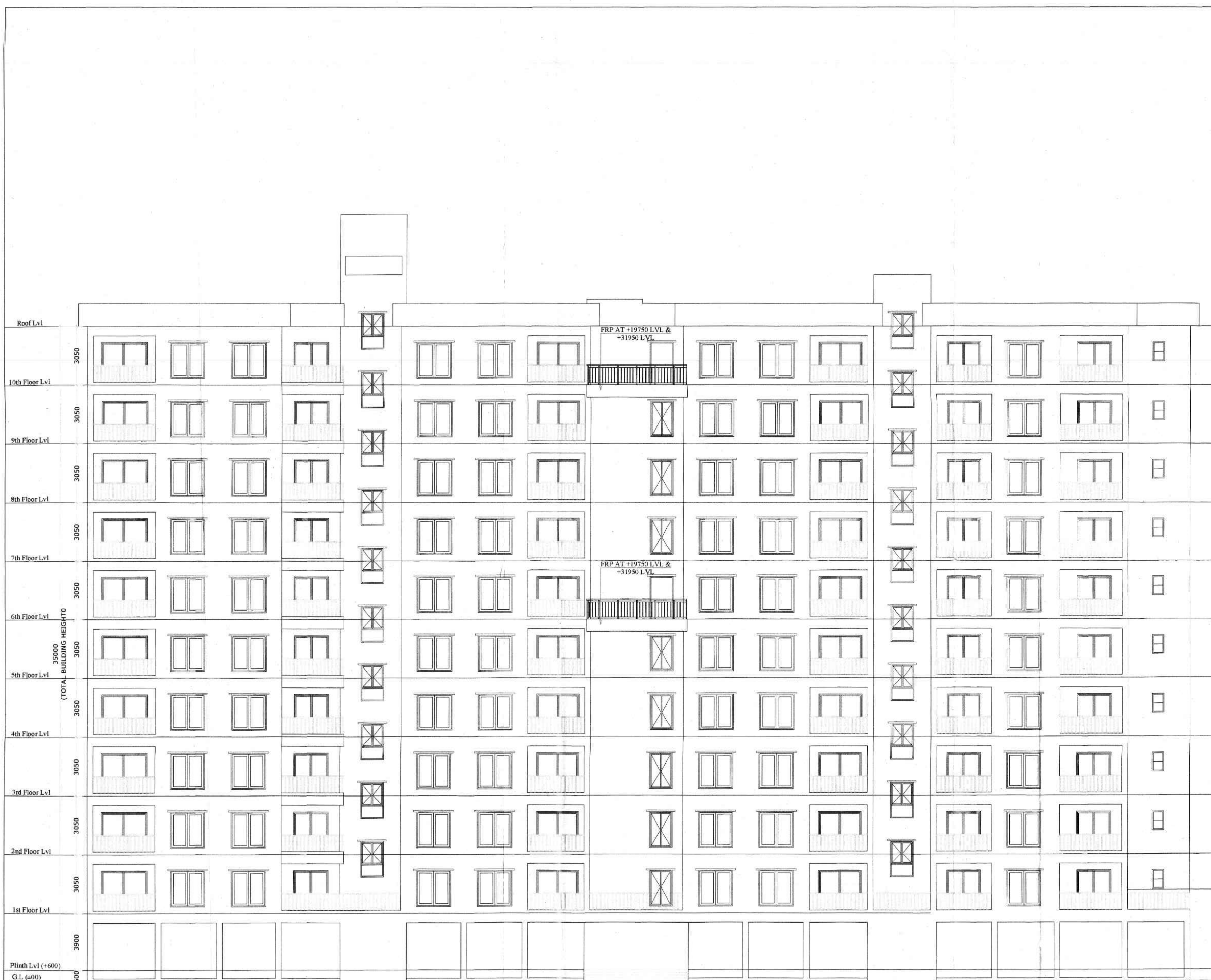
NORTH SIDE ELEVATION SCALE 1:100